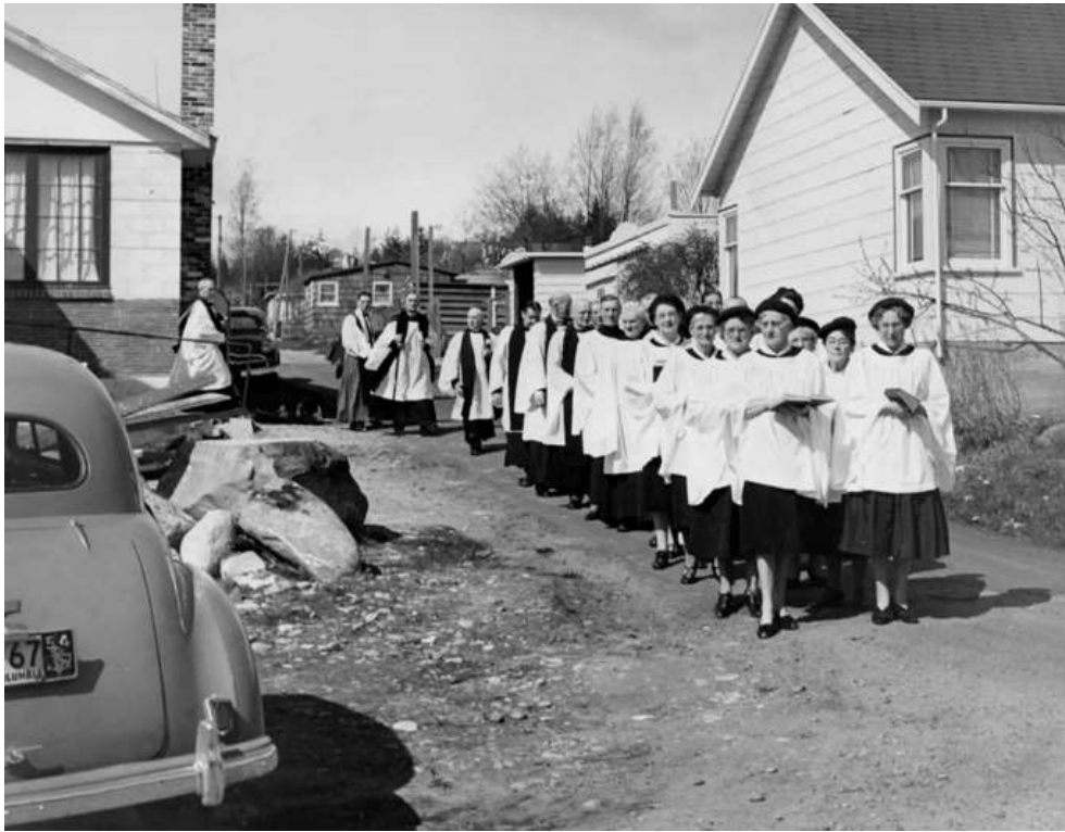
The day is Wednesday, April 21, 1954. The Bishop of New Westminster, the Rt. Rev Godfrey Gower (centre rear) has come to White Rock to dedicate the new Church of the Holy Trinity Church. Here the choir is processing down the 'back lane' from the Church Hall, built earlier and now including the spaces of the current offices, library and kitchen.